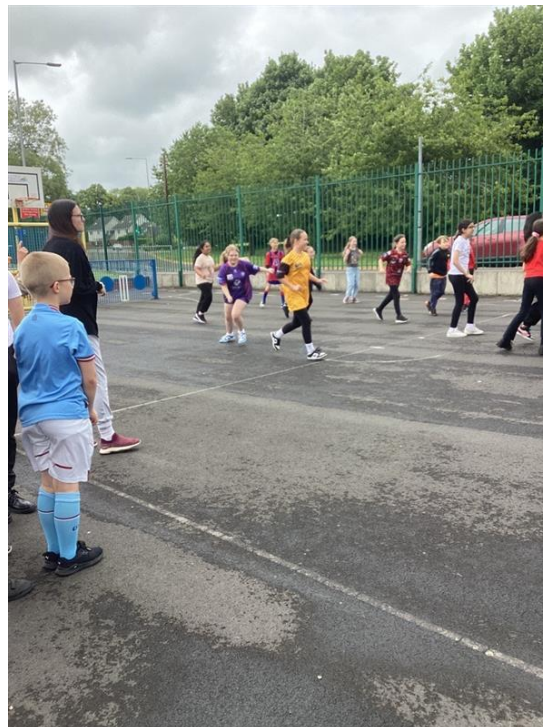
Year 5 and 6 – Playing football

Here are a few photos of the children doing some sporting activities today: