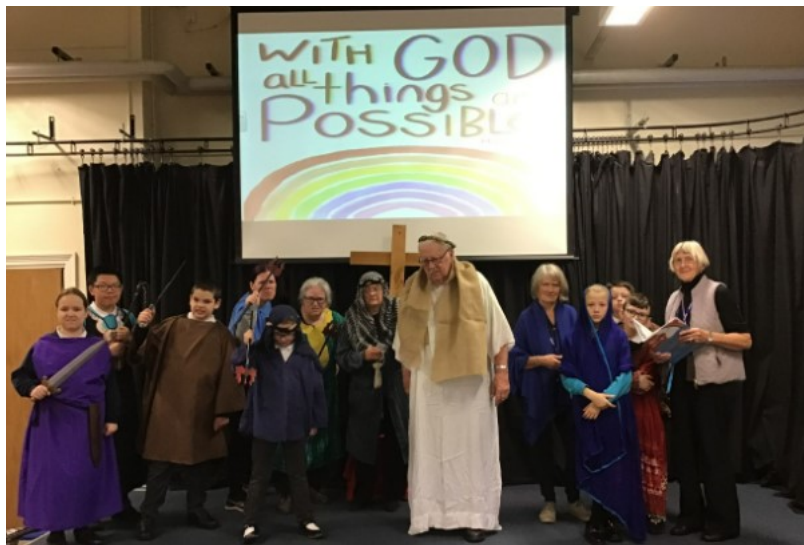
Pupils and members of the Methodist circuit in their enactment of 'The Dreadful Day'

As usual, this was a resounding success. Pupils really enjoyed the worship and will take time to reflect upon this in their classroom learning