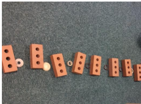
Cosma used bricks and wooden rings to make this repeating pattern

This term we have focused deeply on the numbers one and two; learning how these looks as: a numeral, tally, value, shape, number pattern and on fingers. We have created repeating patterns with counters, blocks, pictures and autumn treasures.