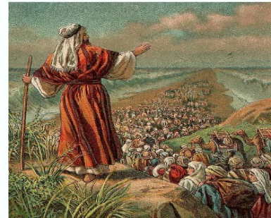
The story of Exodus